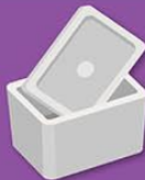
Foam block packaging