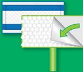
Dry/wet disposable cleaning cloths