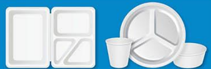
Foam to-go boxes, cups, plates & bowls