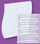
Bubble wrap & pillow packs