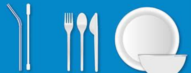
Plastic straws & stirrers