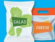
Salad & cheese bags