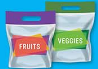
Fresh/frozen veggie/fruit bags